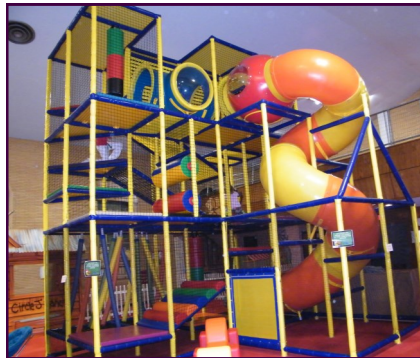
Climbing feature in Paradise Pond.

Plus play time in Paradise Pond, FBC's indoor