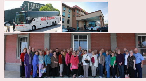
Branson Trip April 2010